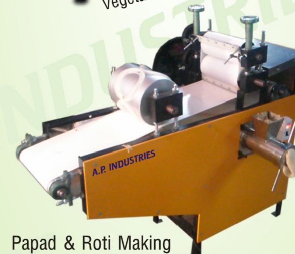
Papad & Roti Making