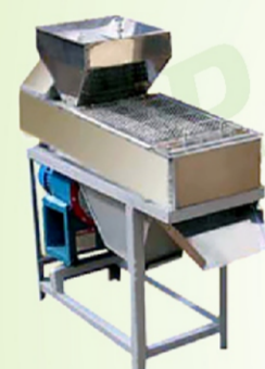
Peanut Dry Peeling Machine