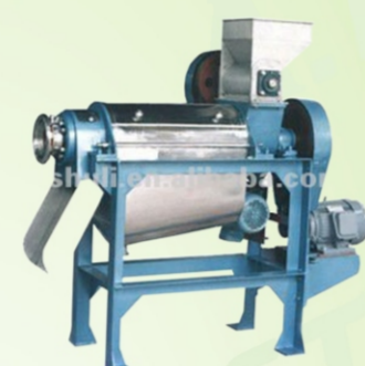
Lemon Juice Machine