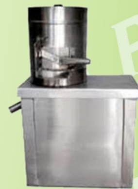
Wet Garlic Peeler