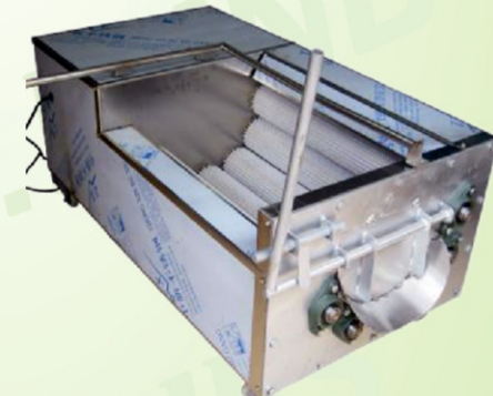
Potato & Onion Peeler