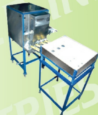
Lemon Cutting Machine