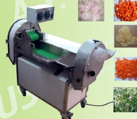
Multi Vegetable Cutting