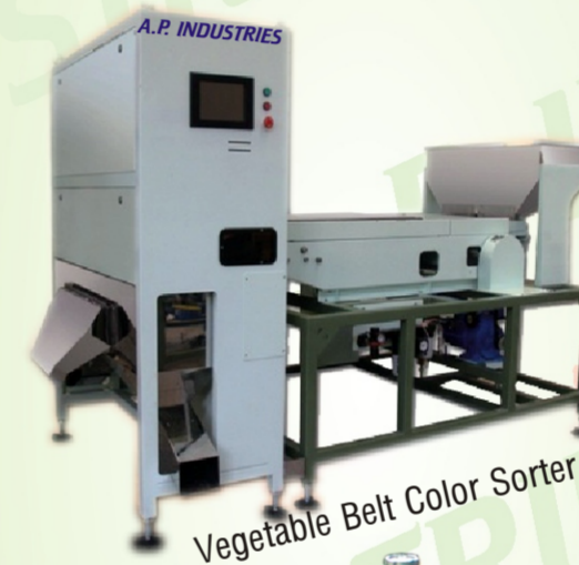
Vegetable Belt Color Sorter