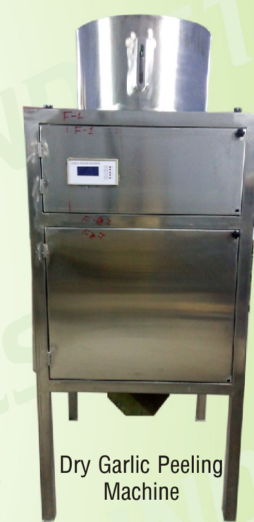
Dry Garlic Peeling Machine

All Type Foods Processing Machines & Foods Griding Machines, Foods Peeling Machines, Foods & Seeds Color Sorter & Requirement Machines Manufacturers Good Service and Good Product