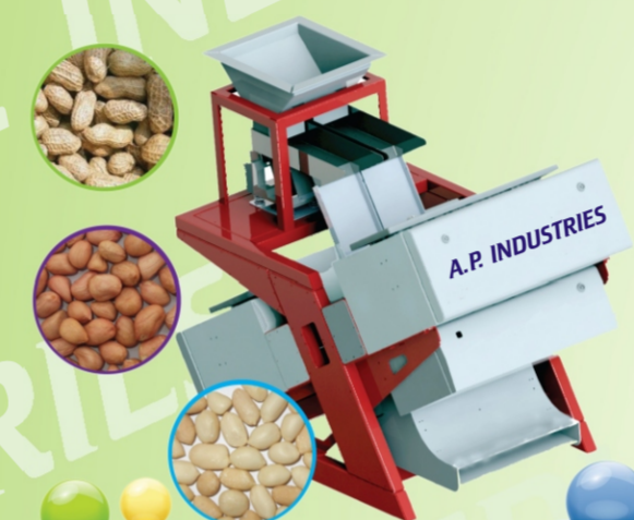
Seed Color Sorter