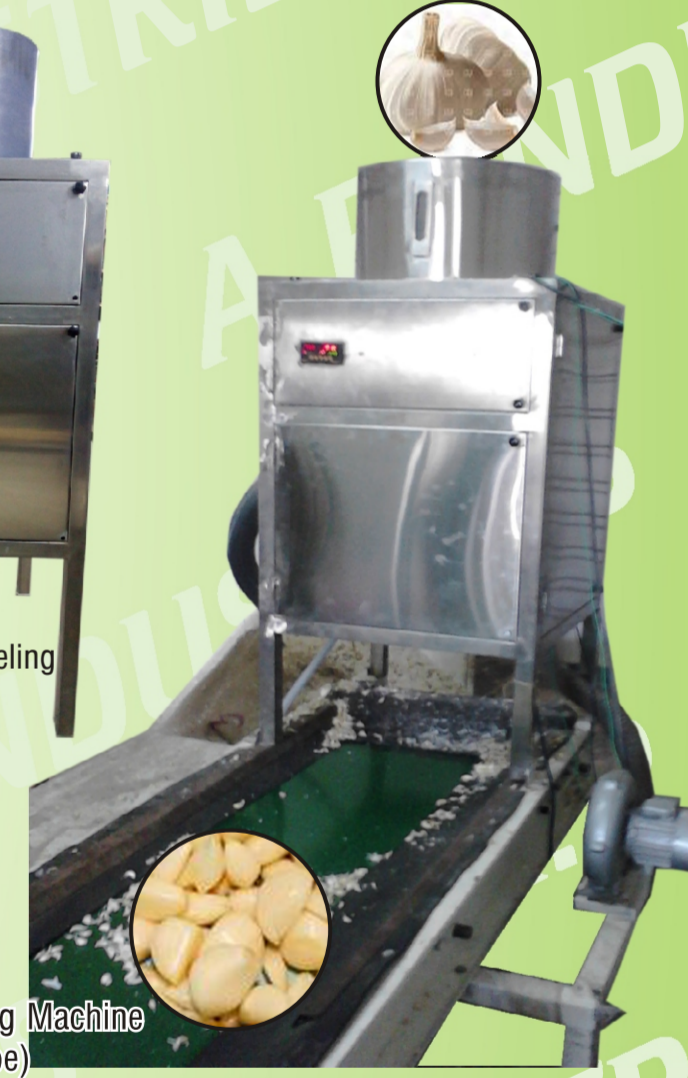
Dry Garlic Peeling Machine (Belt Type)