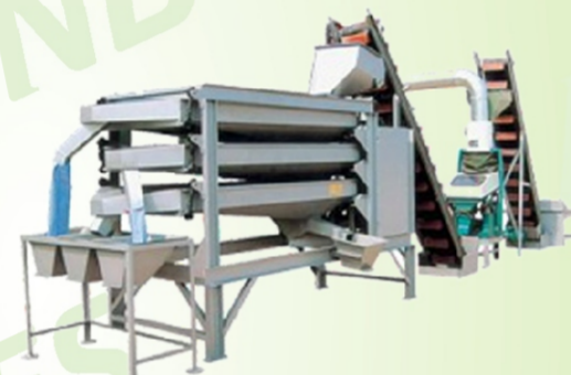
Seed Grader Line Machine