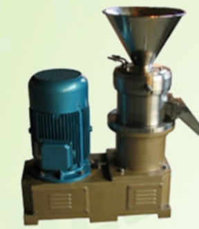
Peanut Butter Machine